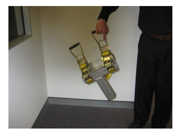
Carrying the Lifting Brackets