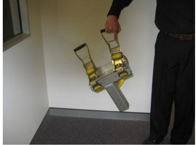
Carrying the Lifting Brackets